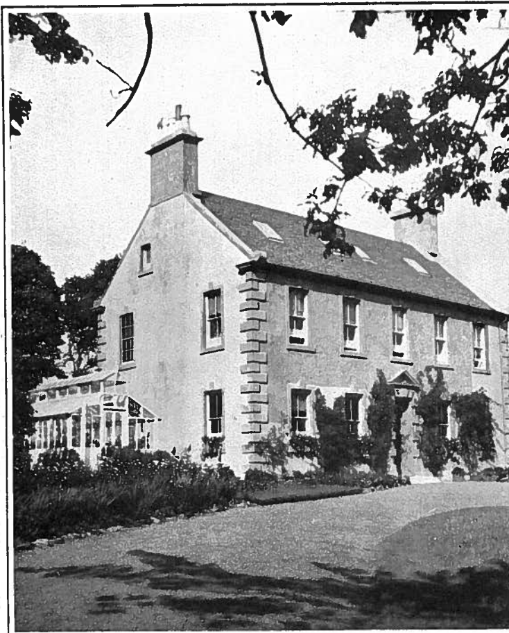
Hunters Hill House, Bishopbriggs, Glasgow. Birthplace of Thomas Muir.