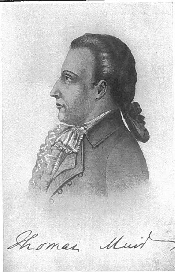
Thomas Muir. From "Mackenzie's Reminiscences of Glasgow."