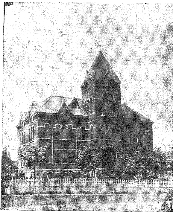
... VANCOUVER COLLEGE ...