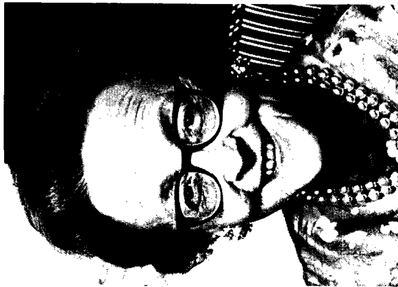
BARBARA WARD JACKSON