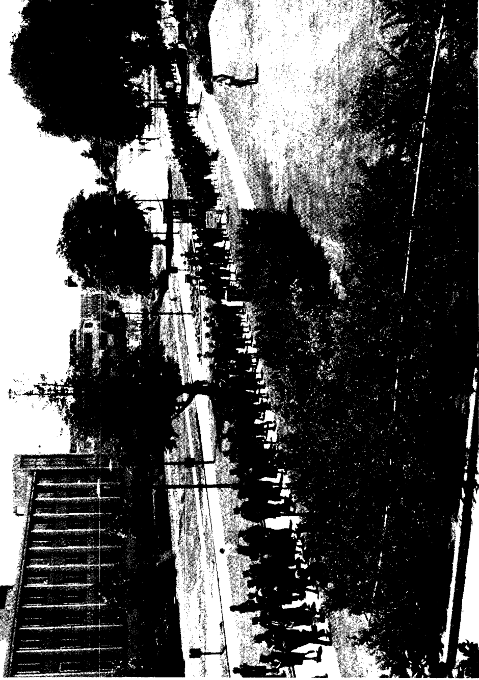
Parade of graduating students approaches site of Congregation ceremony in War Memorial Gymnasium.