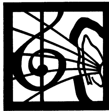
Brass Ensemble Monday at 12:30