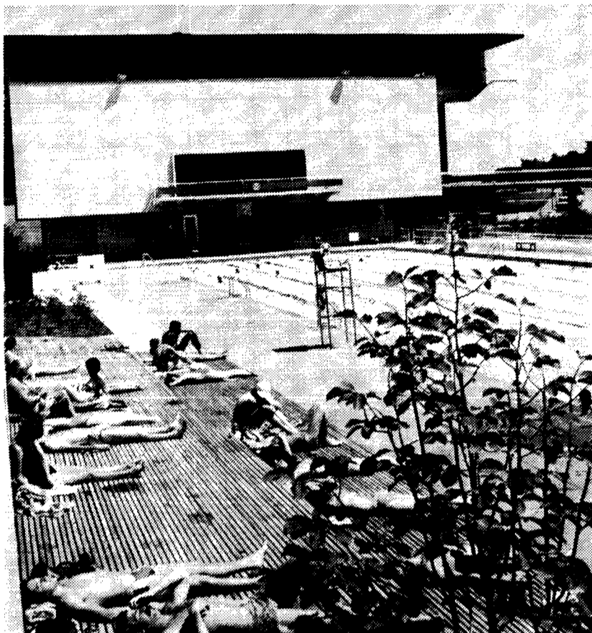
"Inactivity" (shown at left) could be your choice for a summer UBC "activity" between or after classes — or you might choose a more active "activity" as demonstrated at right in photo. Both are taking place at the UBC Aquatic Centre's outdoor pool daily (well...when the sun shines).

For further information about UBC's features, or to arrange a general walking tour of the campus, call Information Services at 228-3131.