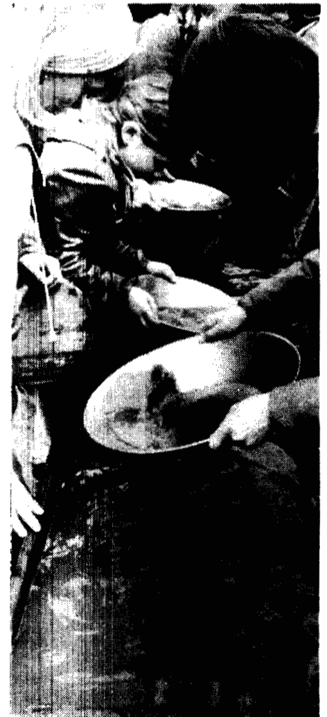
Open House brought many thousands of visitors to campus March 9, 10 and 11 as Agricultural Sciences, Forestry and Engineering set up more than 100 displays and exhibits. At top, newly-hatched chickens fascinate future Aggie student. Gold panning proved popular with future engineers, and a log-sawing competition in Forestry produced hundreds of paving slabs.