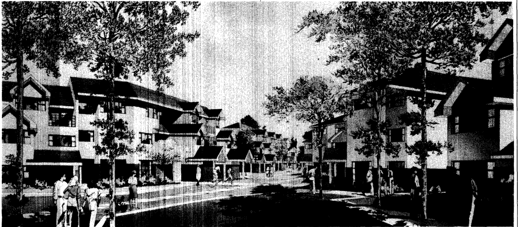
Units of proposed housing development in Acadia area of campus for single students will face onto a 'village street' that will have three entry points.