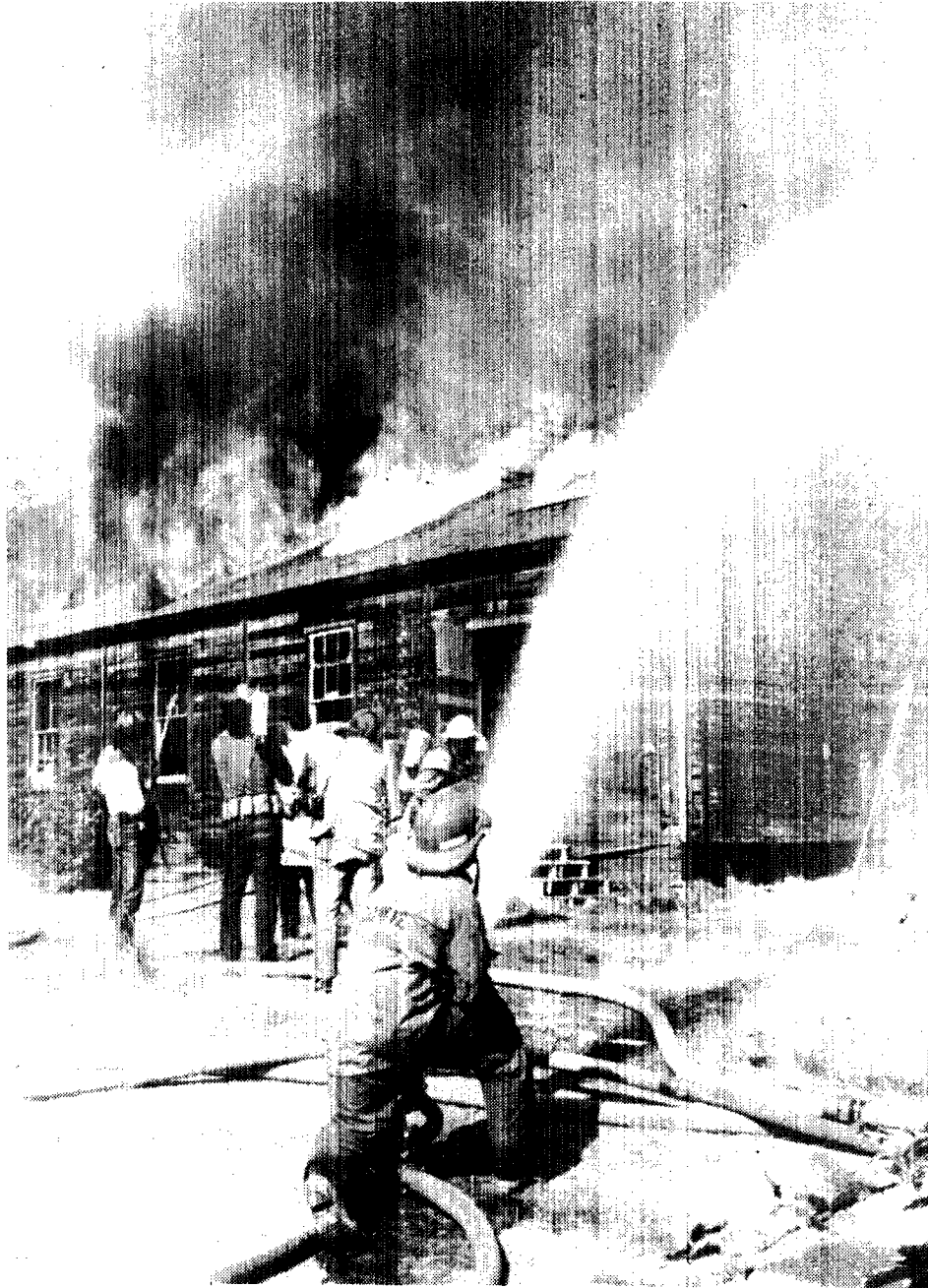
Hut M-27, which ended its life as a social centre for students in Commerce, went up in smoke Thursday (Aug. 30) as part of a training exercise for members of the University Endowment Lands Fire Department. M-27 and adjacent M-28, which was burned as part of the same exercise on Friday, were among the few remaining survivors of the more than 300 army huts brought to the campus after the Second World War to serve as classrooms, laboratories and offices for an expanding faculty and students body. Total of 12 of the old buildings will be demolished by December of this year.

The federal government has announced that it will provide $2.1 million to enable UBC, UVic and SFU to establish a Centre for Asia Pacific Business Studies.