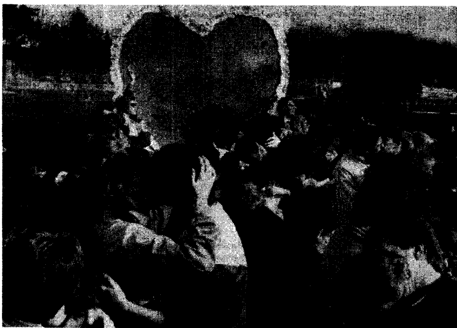
It probably won't make the Guinness Book of World Records (Most people kissing, same time, one place) but UBC's St. Valentine's Day Kissoff on McInnes Field last week raised more than $700 for the Heart Fund.

The $18,000 device, developed in the U.S.,