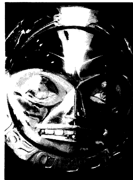
Bronze sculpture Raven Bringing Light to the World by Haida artist Robert Davidson was unveiled recently at the Museum of Anthropology. After two months on display at the museum, the sculpture will be displayed at Canada Harbour Place until the end of Expo 86 and will be shown across the country before being placed permanently at the National Museum of Man in Ottawa.

The use of remote sensing in forestry has enormous implications for improved forest management in B.C.