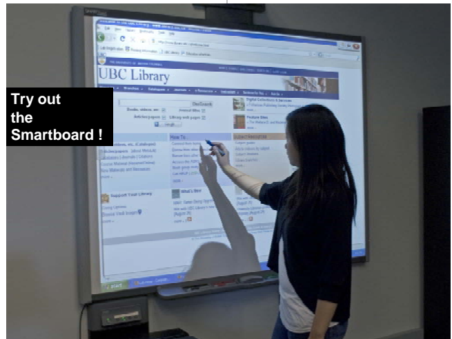
Try out the Smartboard !

The second lab, in the Education library, also had its furniture and computers upgraded. This facility is a smaller six station lab, each set up with round six person tables for more