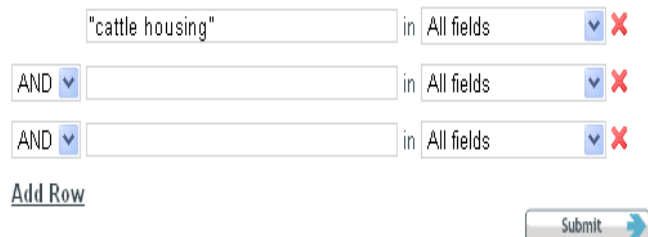
Figure 3: Applying Phrase Searching