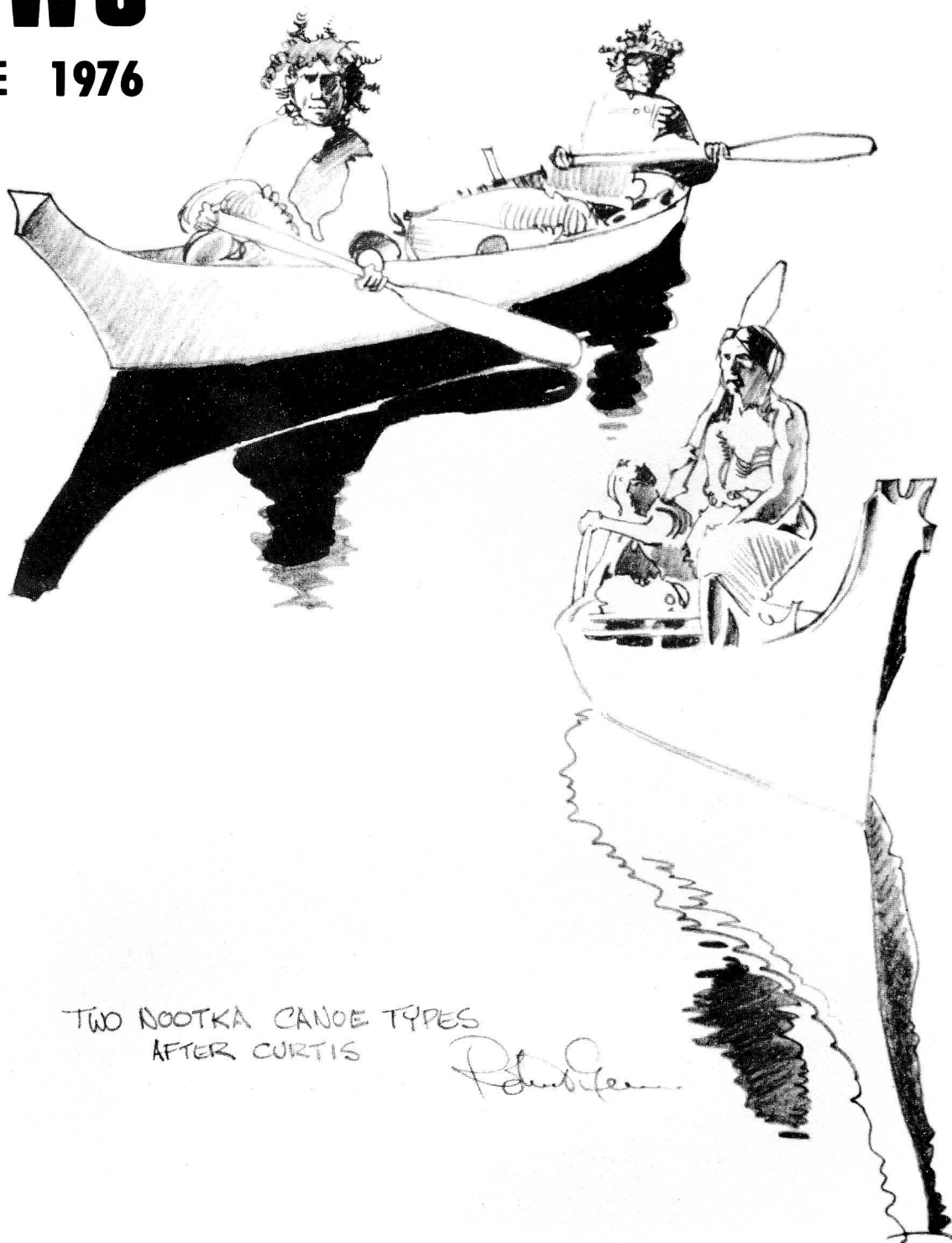
TWO NOOTKA CANOE TYPES AFTER CURTIS