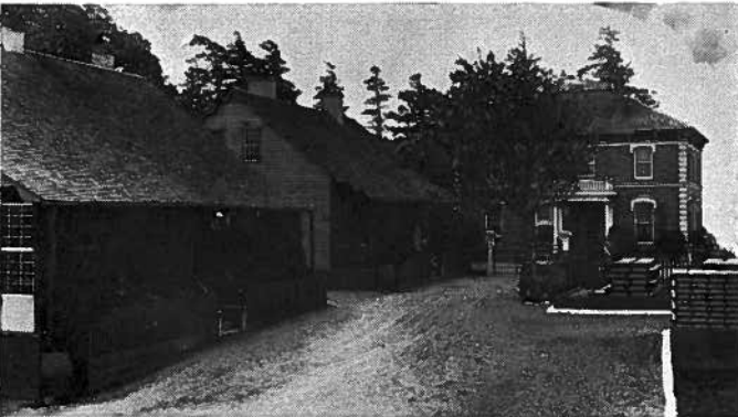
In this photograph are to be seen, from left to right, Buildings Nos. 1 and 2 which survived until 1936 and 1939; and on the extreme right, the Storekeeper's brick house built in 1885.