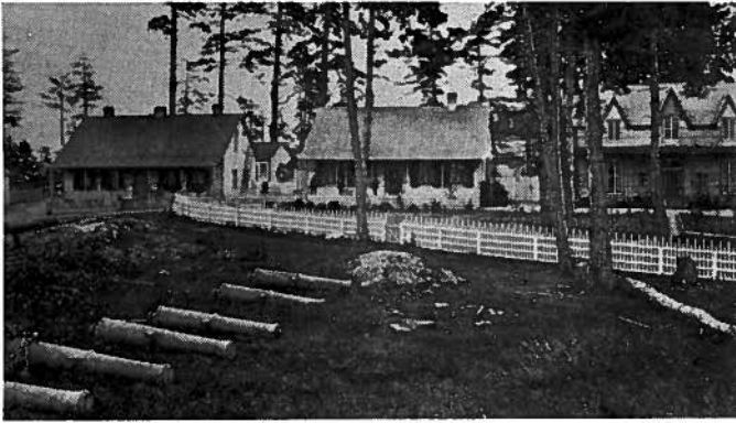
In this photograph all three "Crimean Huts" are to be seen. Building No. 1 on the left is the Dockyard Engineer's house. Building No. 2 in the centre is the office, while Building No. 3 on the right has been altered for a Storekeeper's residence. Date approximately 1870.