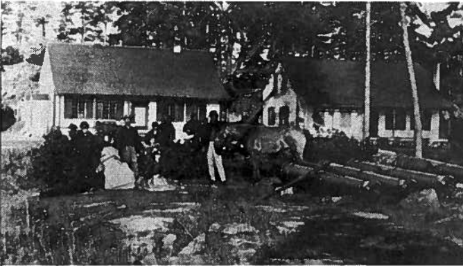
The earliest known view of the "Crimean Huts," showing Building No. 2, the Hospital proper, on the left; and Building No. 3, Doctor Campbell's residence, on the right. Building No. 1 is out of sight to the left of the picture. Date probably after 1862 when the hospital was removed to Skinner Cove.