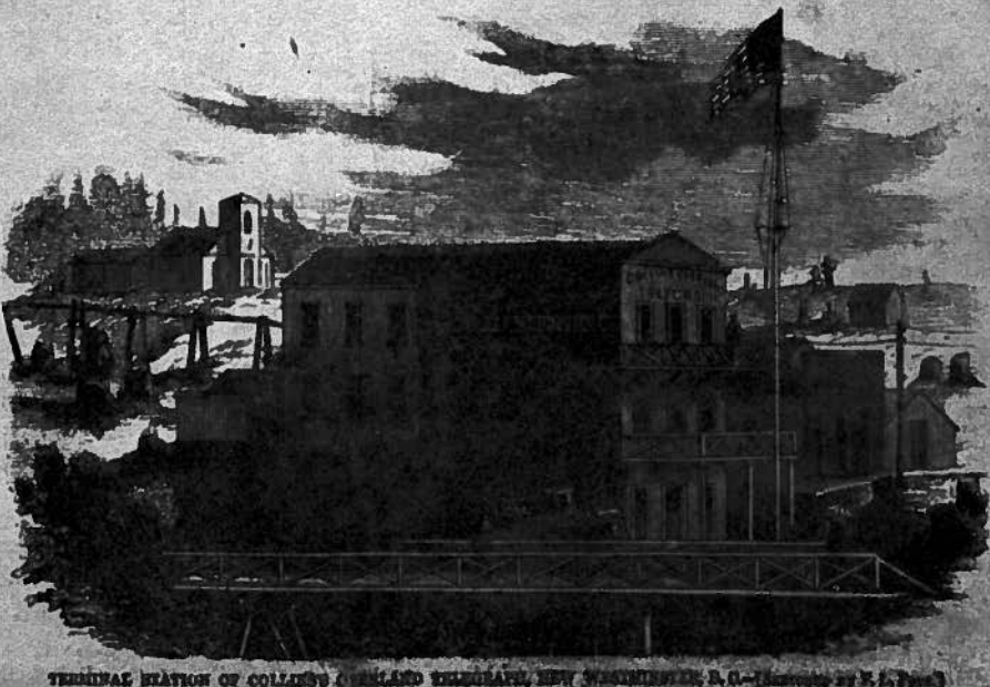
TERMINAL STATION OF COLLINS'S OVERLAND TELEGRAPH, NEW WESTMINSTER, B. C.—[Illustrated by F. L. Fox.]

THE immense enterprise, which is to connect America with Europe by the way of California, Behring Strait, and the Amoor River, is being pushed forward with the utmost energy during the present season, under the auspices of the Western Union Telegraph Company. The wires of the California Telegraph Company have during the past winter been extended through Oregon and Washington Territory, as far as New Westminster, the capital of British Columbia, and are now in operation to that point. At New Westminster the Collins Overland Telegraph proper commences, and will extend up Fraser River nearly to its source, and thence nearly parallel with the coast, following the general direction of the valley between the Rocky Mountains and the Coast Range to a point at or near Behring Strait, which will be spanned by a submarine cable. The line will thence extend through the narrow portion of Alaska and it is expected that the route will be completed by the end of the year.