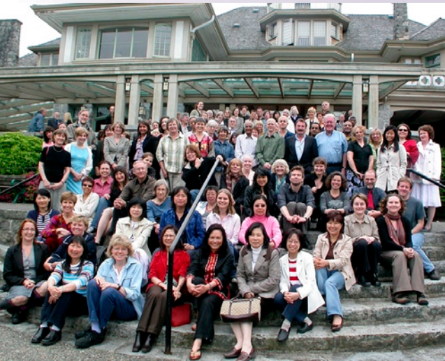
UBC Library staff at Cecil Green Park House, June 2007.

UBC Library recognizes that its staff are its most important resource in supporting research and learning. It places a high priority on providing an environment conducive to effective study, learning and community building.