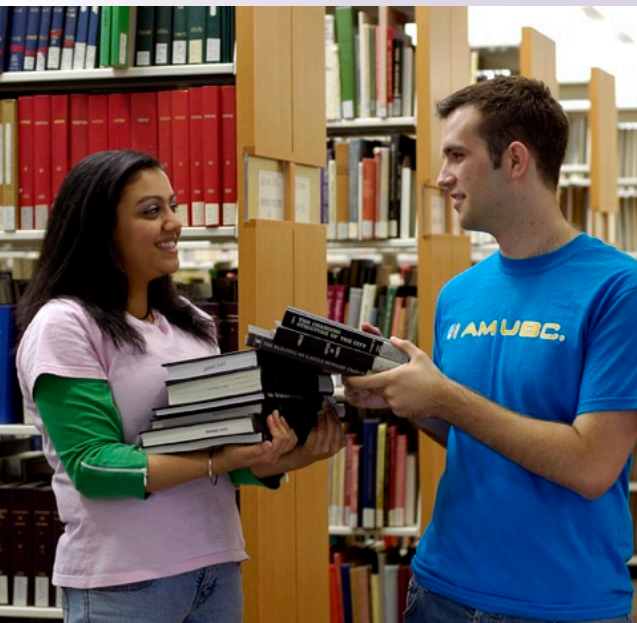
Collaboration is key at UBC Library.

UBC LIBRARY continued to participate as a member of many consortia and library associations during the reporting period, including the Association of Research Libraries, the British Columbia Electronic Library Network, the Canadian Association of Research Libraries, the Canadian Research Knowledge Network (CRKN), the Council of Prairie and Pacific University Libraries, the Electronic Health Library of B.C. and the Pacific Rim Digital Library Alliance.