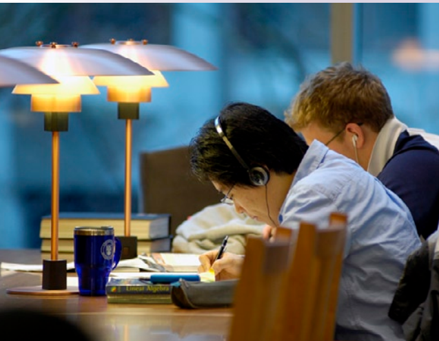
UBC Library: dedicated to serving users across the spectrum.

ON A CHALLENGING NOTE, UBC Library will need to account for its share of the University's budget shortfall. Steps will combine collections cuts, two branch closures (involving the MacMillan and Mathematics libraries) and various other cost reductions. Staff will work closely with faculty and students to ensure that these developments have a minimal impact on research and learning activities. Services will be reviewed on a recurring basis.