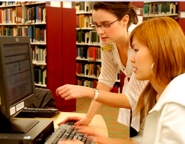
UBC Library staff answered hundreds of thousands of questions in 2006/07.

LEARNING AND RESEARCH SUPPORT are core to UBC Library's mission, and this support takes many forms. Staff members answer questions at reference and information desks, respond to e-mail enquiries, engage users in live electronic chat and instant messaging, create electronic and in-person tutorials, and provide ongoing Library instruction.