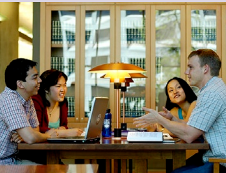
The Irving K. Barber Learning Centre supports lifelong learning for the students of today and tomorrow.

The Irving K. Barber Learning Centre's vision integrates learning, outreach and research support, innovative programs and flexible spaces. During this reporting period, construction continued on the second and final phase of the Learning Centre, which is scheduled to open in January 2008.