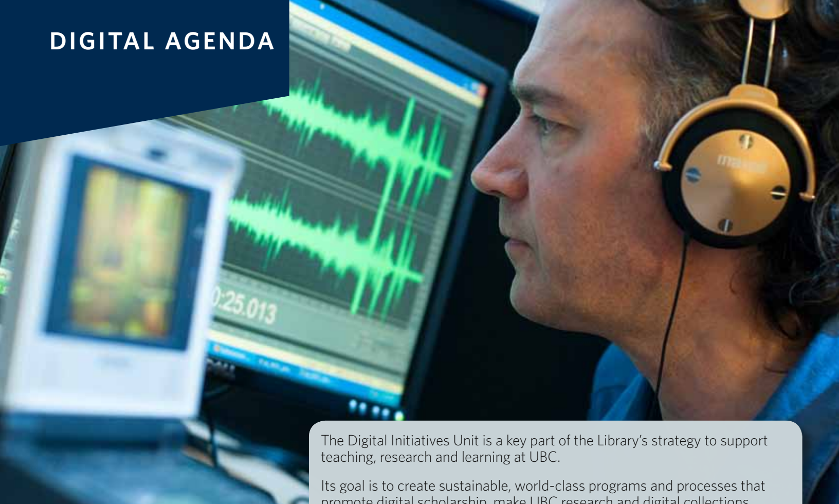
A Digital Initiatives Librarian works on digitizing audio records.

The Digital Initiatives Unit is a key part of the Library's strategy to support teaching, research and learning at UBC.