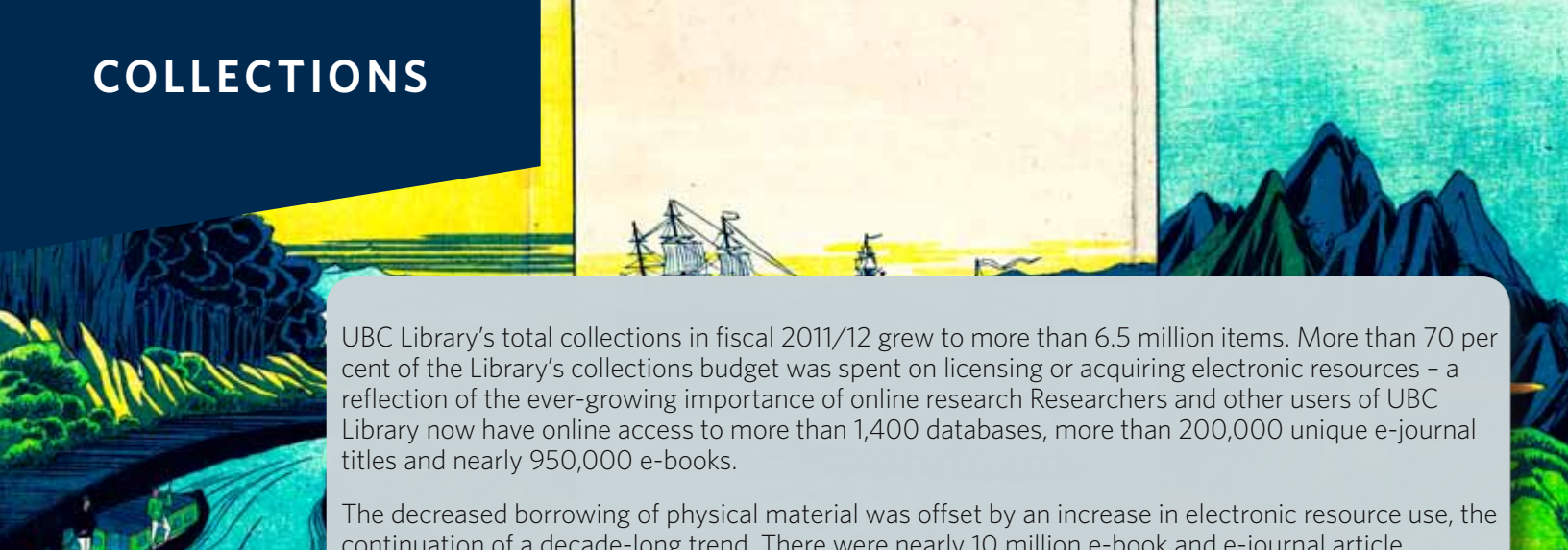
Kaisei chiri shoho ansha no zu (Elementary geography). Map from the Japanese Maps of the Tokugawa Era collection.

UBC Library's total collections in fiscal 2011/12 grew to more than 6.5 million items. More than 70 per cent of the Library's collections budget was spent on licensing or acquiring electronic resources – a reflection of the ever-growing importance of online research. Researchers and other users of UBC Library now have online access to more than 1,400 databases, more than 200,000 unique e-journal titles and nearly 950,000 e-books.