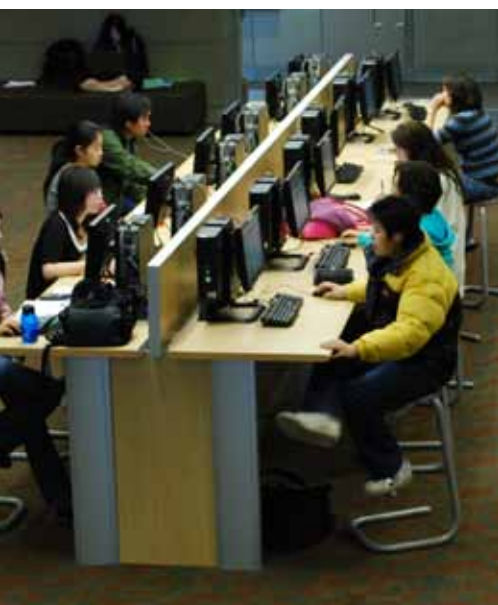
Students gathered in the Irving K. Barber Learning Centre.

Those are some of the highlights at UBC Library for 2011/12 – I invite you to read the rest of this report for updates on collections, support, the digital agenda, the road ahead and more. Finally, I would like to offer my sincere thanks to all of the Library's staff for their contributions over the past year. Their efforts ensured that UBC Library remained on track with its strategic plan, and continued to offer the excellent resources and services that define a 21st-century research organization.