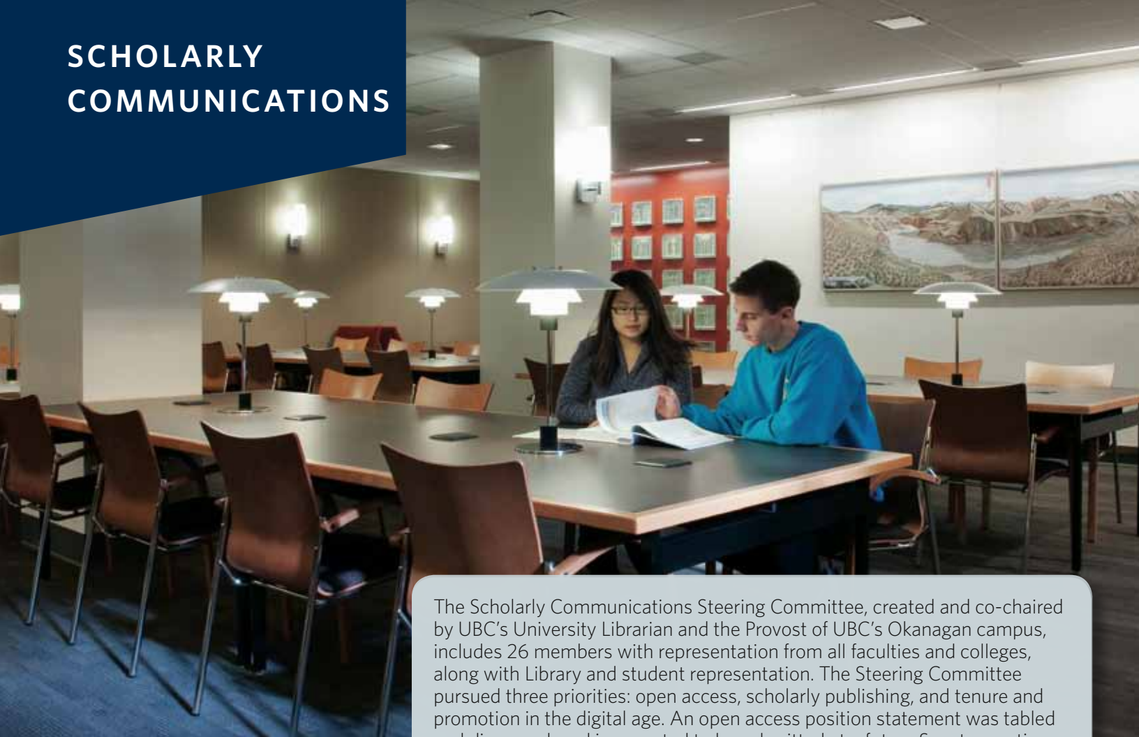
Woodward Library's lower level provides a welcome space for study and research.

The Scholarly Communications Steering Committee, created and co-chaired by UBC's University Librarian and the Provost of UBC's Okanagan campus, includes 26 members with representation from all faculties and colleges, along with Library and student representation. The Steering Committee pursued three priorities: open access, scholarly publishing, and tenure and promotion in the digital age. An open access position statement was tabled and discussed, and is expected to be submitted at a future Senate meeting. A report on university publishing was submitted, and recommendations will be considered in the coming year. Committee members also produced a report detailing the challenges facing promotion and tenure committees, which are increasingly presented with newer forms of scholarship (including websites, wikis, blogs, social media, e-books, e-journals and more) and evaluation metrics.