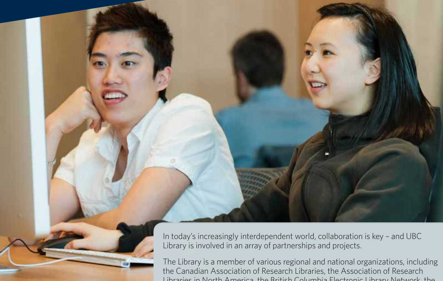
Students can work collaboratively in many Library spaces.

In today's increasingly interdependent world, collaboration is key – and UBC Library is involved in an array of partnerships and projects.