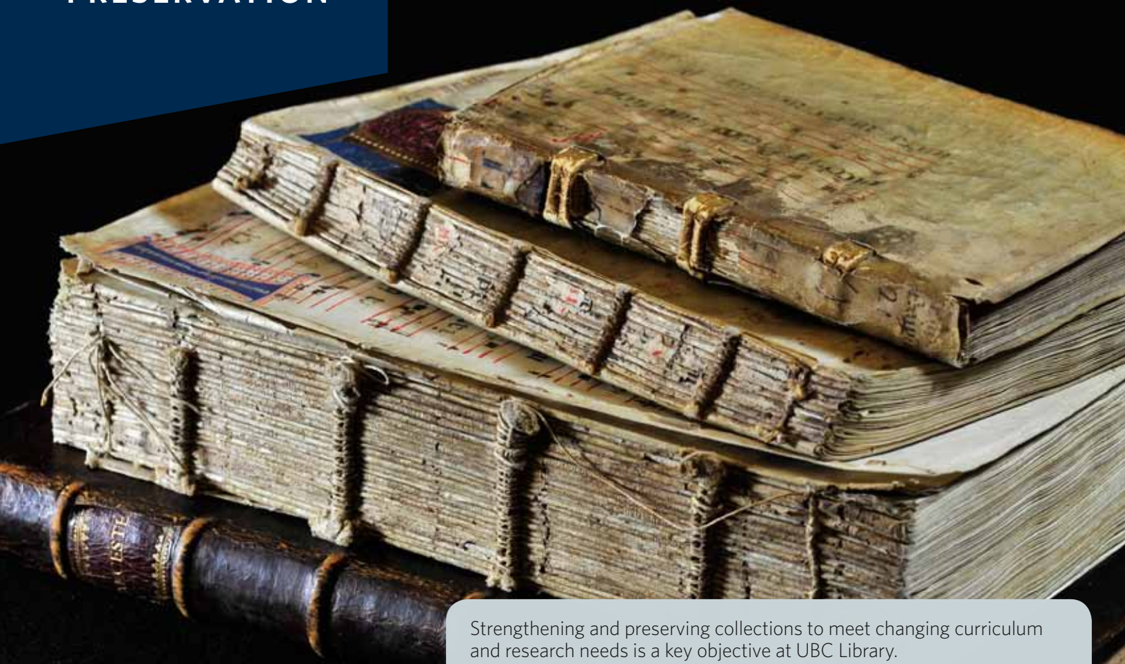
A collection of graduals and chants from Rare Books and Special Collections.