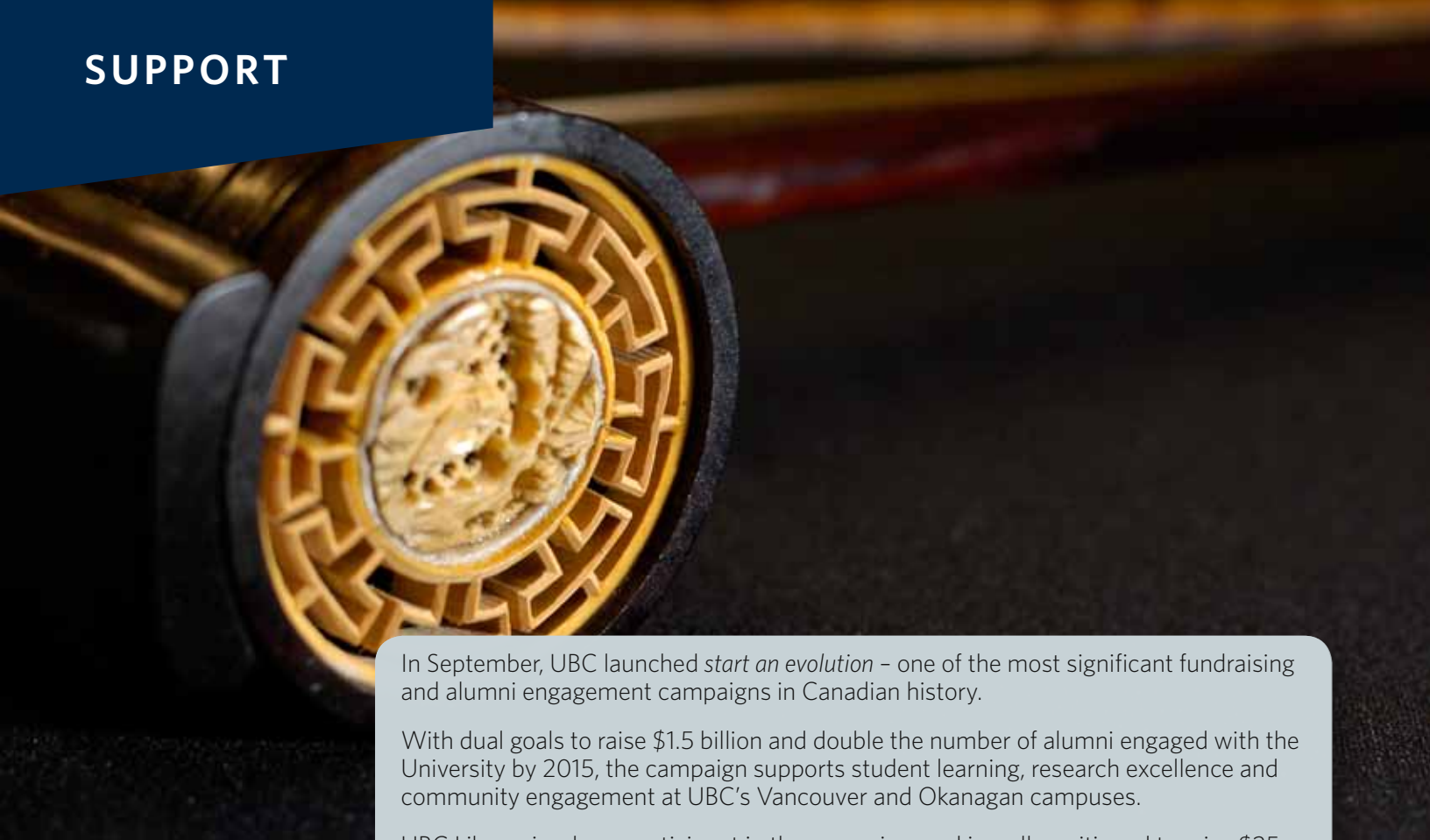
Detail from the Puban collection in UBC's Asian Library.

In September, UBC launched start an evolution – one of the most significant fundraising and alumni engagement campaigns in Canadian history.