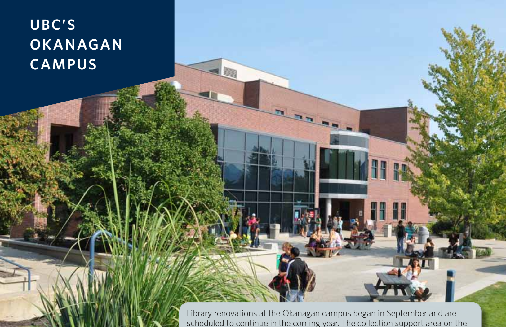
UBC's Okanagan Library sits at the centre of campus.

Library renovations at the Okanagan campus began in September and are scheduled to continue in the coming year. The collection support area on the third floor was expanded, and special collections material was placed in a temporary location. In February, work on the second floor for a new staff area was completed.