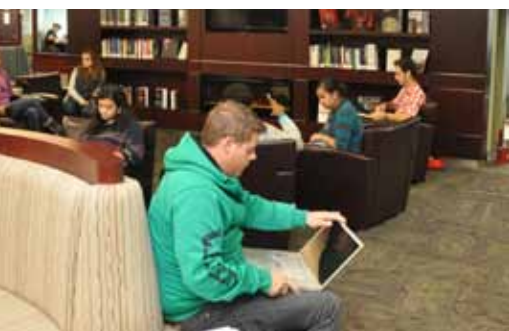
Students gather at one of the welcoming spaces at the refurbished Okanagan Library.

The Centre for Scholarly Communication at the Okanagan campus opened in July to support graduate students and upper-level undergraduate students as they share their research with the academic and broader communities. The Centre, a two-year pilot project, is housed in the Library, and reports to the Chief Librarian and the Director of the Centre for Teaching and Learning at the Okanagan campus. It offers special programming, workshops, writing groups and one-on-one consultations. Highlights included a series of talks entitled "Editor's Forum," where editors spoke to students about the scholarly publication process; a panel on the use of digital media to conduct and disseminate research; and a four-day Boot Camp consisting of workshops and other events to help students with writing projects.